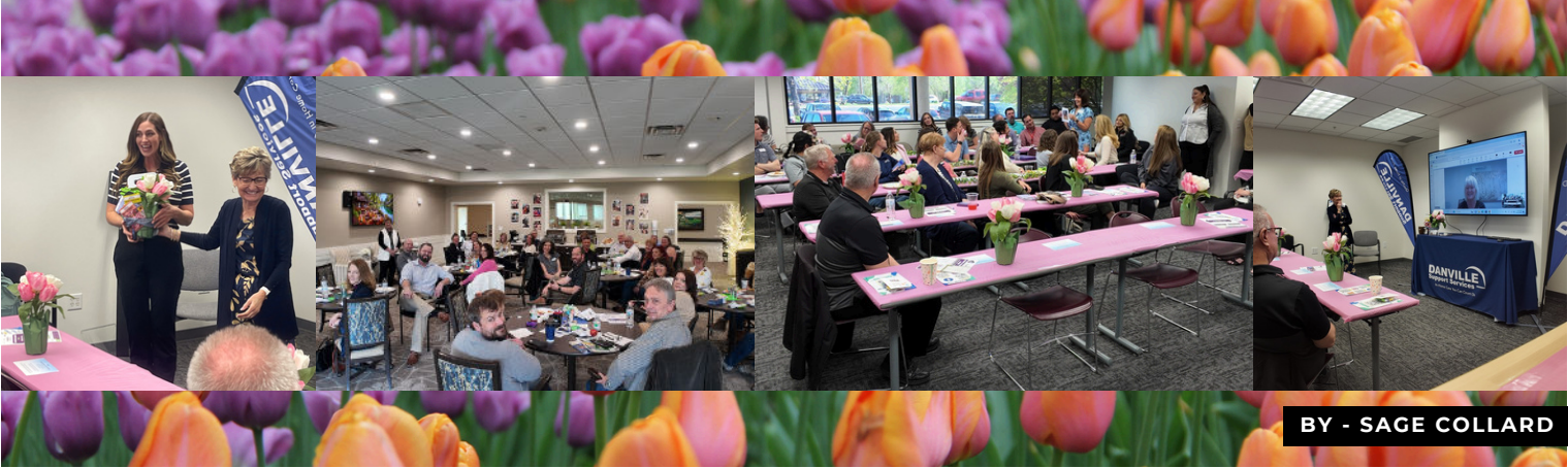
BY - SAGE COLLARD